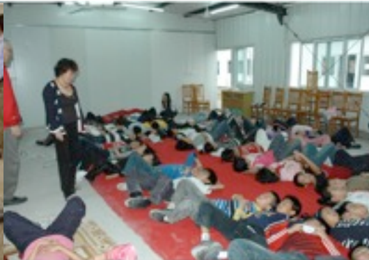
CHINESE EARTHQUAKE CHILDREN